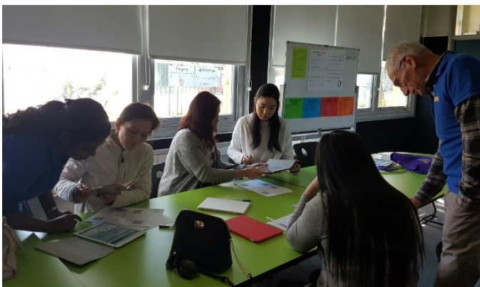
ICT Workshop 2 – Google Classroom & Google Applications