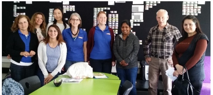
With the St Vincent De Paul Society SPARK Team