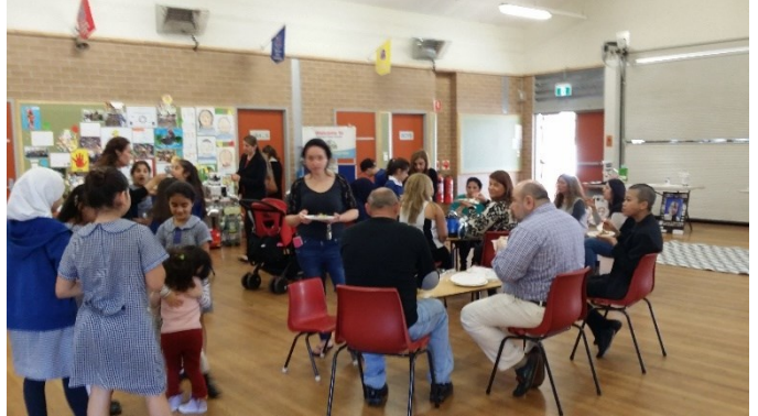
Our Fairvale Community – One Big Family