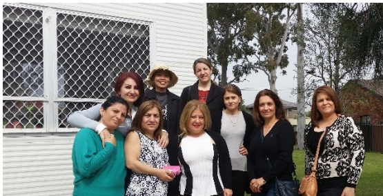
Cooking with Parents and Friends