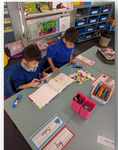
Working in Kindergarten!