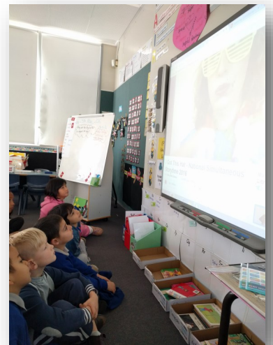
Simultaneous Story Time